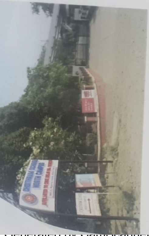
Sr. No. 4/3/2/1 Part, 4/3/2/2, 4/3/2/3, 4/3/2/4, 4/3/2/5, 78/2/1, 78/2/2 & 78/2/3, Gram Nipania, Indore, (M.P.)