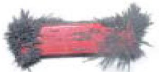
Fig. Iron filings sticking to a bar magnet

Do you observe that more iron filings get attracted to some parts of the magnet than others . Repeat the