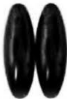
Oval shape magnet